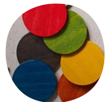
Optional shell in bright colours