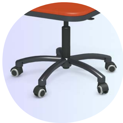
Sturdy 5 - star aluminum base, optionally with self-braking castors