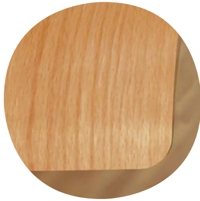
Massive beech ply shell, eco-friendly painted with water based paint