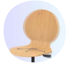
Optional 2-D or 3-D rocker